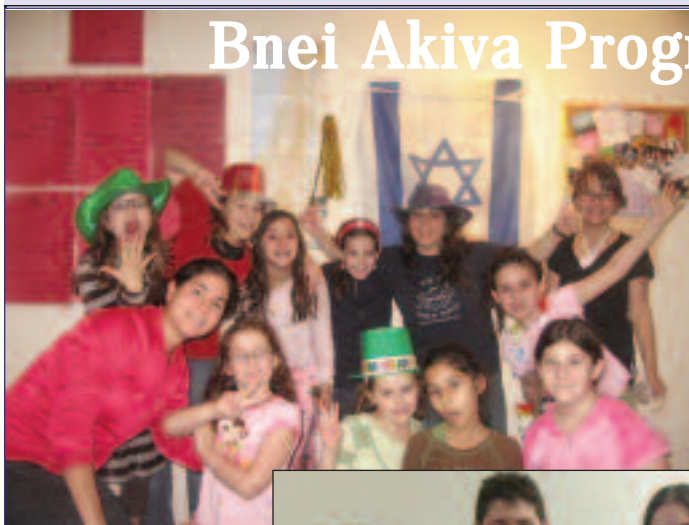
Upper left and lower photos: Sleep over fun at the Bnei Akiva "bayit."