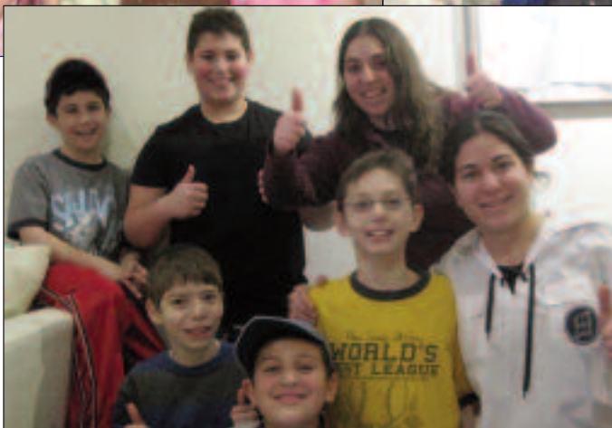
Upper right photo: Bowling night in Times Square